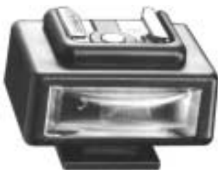
CSA576 Hot Shoe Slave Trigger

Converts hot shoe flash guns into a slave triggered flash. Small (1 x 1/2 x 3/4), lightweight (6/10 oz.), easy to carry. Omni-directional, sensitive to 25ft. Mounts on camera shoe, tripod, or light stand.