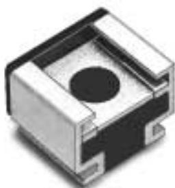
CSA552 Hot Shoe to PC Adapter

Converts hot shoe of camera to PC socket. Allows use of non-hot shoe flash units. Fits into camera hot shoe. Provides shoe for flash on top. Samigon blister pack. Master: 10.