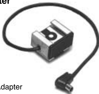
CSA555 PC to Hot Shoe Adapter

Provides hot shoe contact for non-hot shoe cameras that allow use of hot shoe flash units. Fits onto camera. Cord plugs into PC outlet of camera. Samigon blister pack. Master: 10.