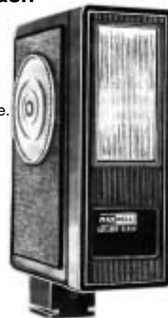
CSA315 AC/DC Electronic Flash

Includes: AC power cord, PC cord, and Built-in exposure calculator.