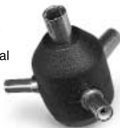
CSA520 Multi-PC Terminal - 3 outlets

Enables synchronized firing of up to 3 flash units simultaneously. Insert male PC plug of Multi-Terminal into camera PC socket. Connect up to 3 flash units with PC cords. Made in Germany. Samigon blister pack. Master: 18.