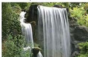
With ND8 Filter