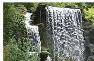
Without ND8 Filter